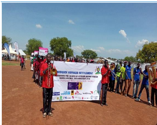
Commemoration of the 16 Days of Activism in Bidibidi settlement