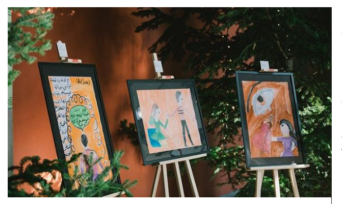
Art Exhibition on Gender-Based Violence, with artworks created by refugee and migrant children and adolescents, Thessaloniki, Greece

Gender-Based Violence: UNICEF's gender-based violence programming continued to develop throughout 2018 with the establishment of a MoU with the General Secretariat for Gender Equality (GSGE) in June 2018 and new partnerships to carry out targeted GBV trainings with multi-disciplinary teams, educators and frontline workers, as well as GBV research on service accessibility.