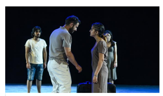
A scene from 'The Journey'- a youth theatre piece bringing together adolescent refugees, Greek teenagers and actors from the Greek National Theatre.

During the summer, a football camp was also organised- primarily for 247 unaccompanied children, boys and girls, from shelters in urban Athens. The camp ran from June to August 2018 taught children important skills such as respect, teamwork and discipline.