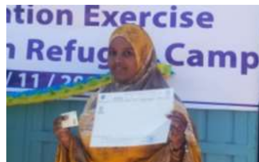
(Pictures from left to right: (i) Refugee undergoing comprehensive registration and BIMS enrolment at Jijiga/Kebribeyah camp (ii) Refugee woman receiving proof of registration document after level 3 registration exercise in Nguenyiel camp, Gambella (iii) Refugee receiving proof of registration and refugee ID card in Jijiga/Kebribeyah camp)