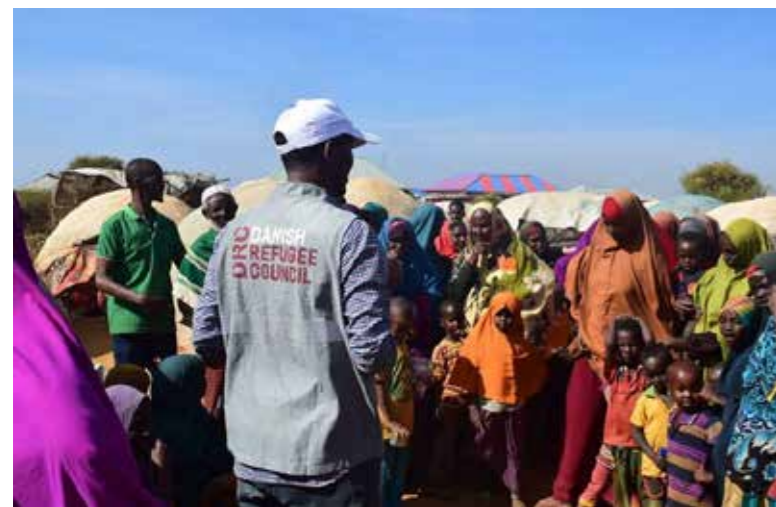
CCCM outreach team conducting site monitoring in IDP sites in Baidoa, January 2019

Data collection for the Detailed Site Assessments was finalized. Data was collected in seventeen regions of Somalia, including 44 districts. The data set will be available by the end of February.