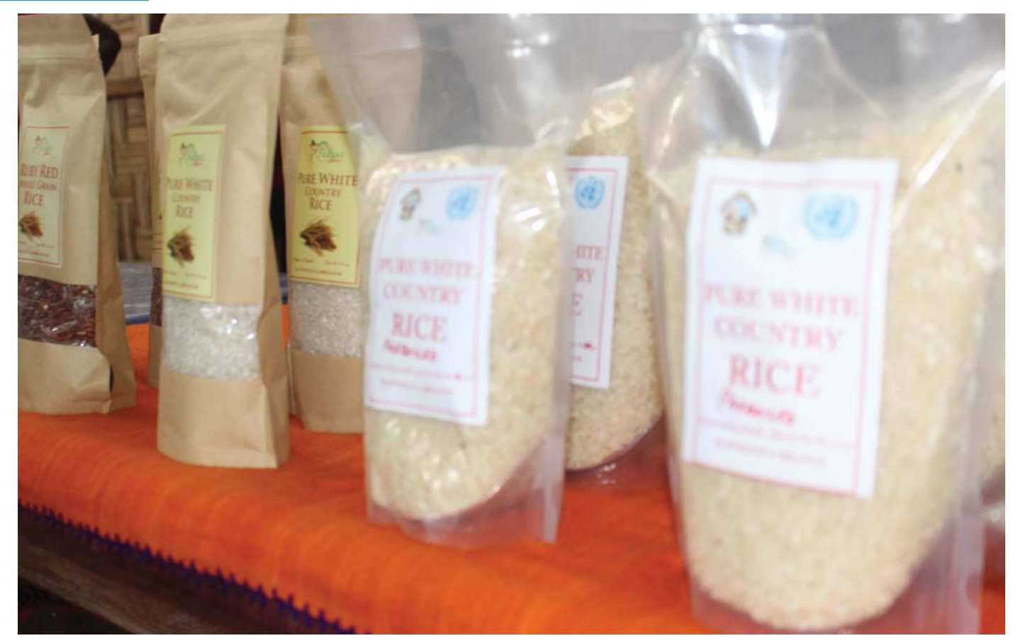
Packages of differenct kinds of rice produced by the project for the market

"I am impressed with the project and not only that but the produce and commitment of the farmers and partners as they go about these activities to earn a living. We can do better, we can achieve more once we invest our time, energy and resource in agriculture." Mr. El Hillo said speaking to farmers and partners.