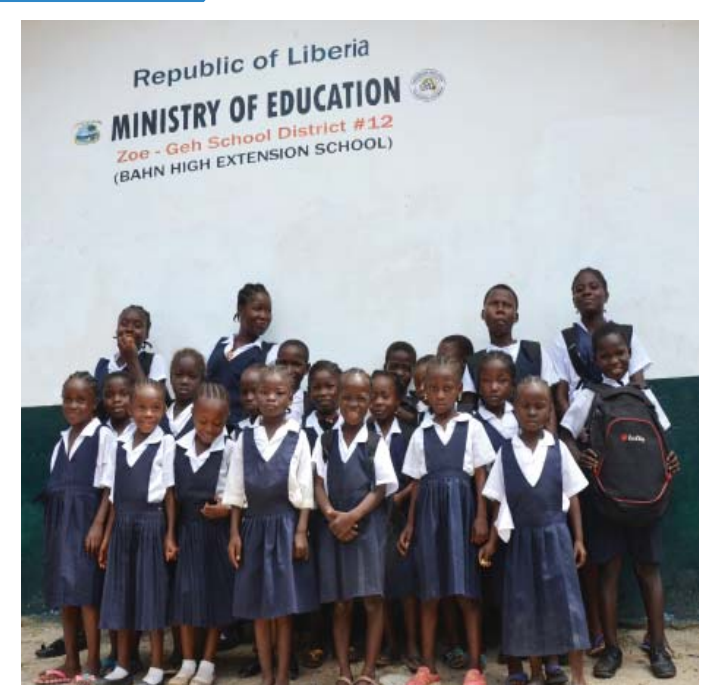
Students in the public school Bahn High Extension School (Bahn Refugee Camp, Nimba County), with uniforms distributed by UNHCR.

However, some refugees cannot return because they fear persecution, while others simply wish to remain in Liberia.