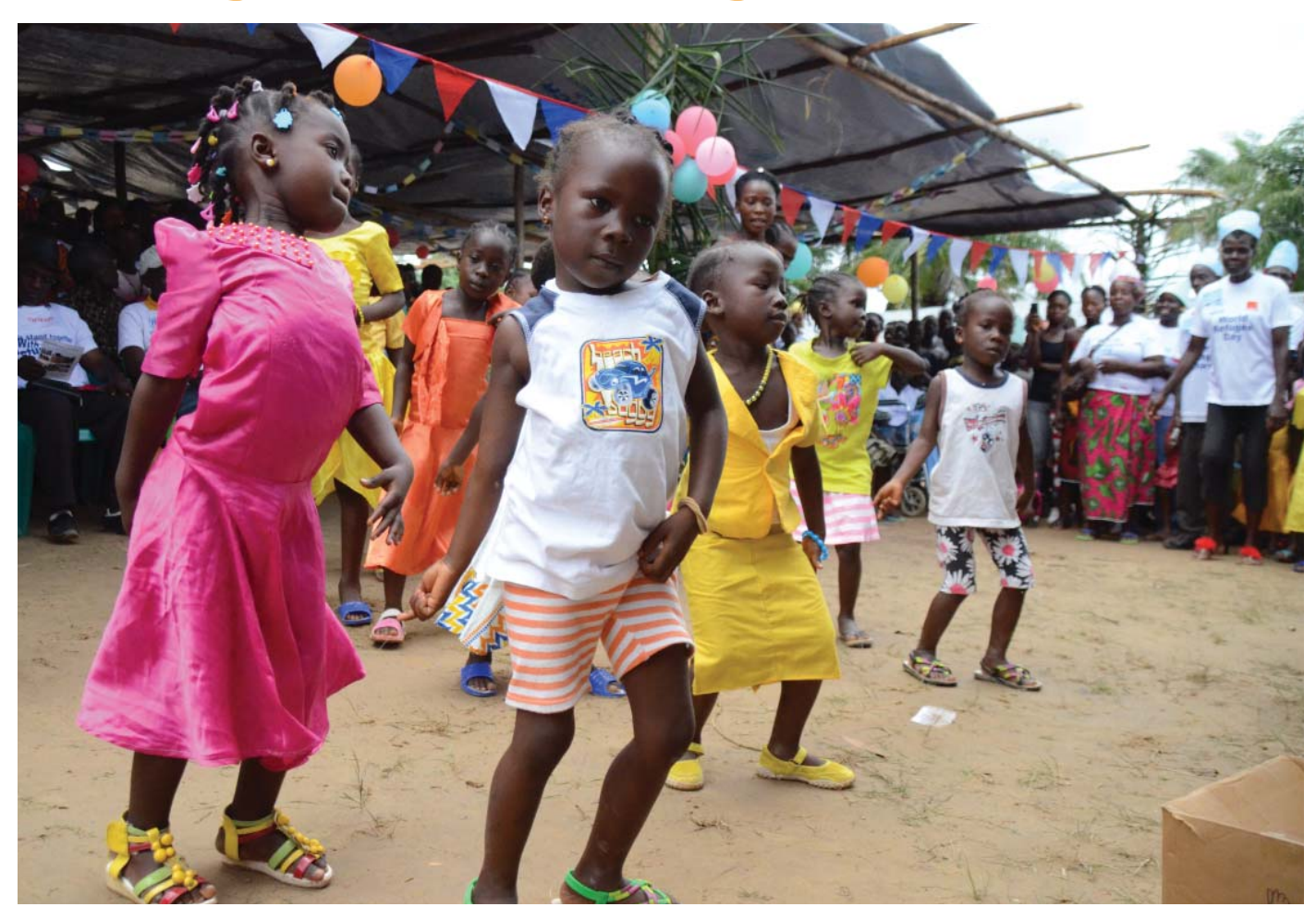
Refugee children dance in celebration of World Refugee Day in Bahn Refugee Camp (Nimba County).

n 20 June 2018, Liberia celebrated the resilience of refugees and the generosity of the communities hosting them. UNAgencies and partners attended World Refugee Day celebrations in the three remaining refugee camps: Bahn Camp (Nimba); PTP Camp (Grand Gedeh); Little Wlebo Camp (Maryland), as well as in Paynesville (Monrovia).