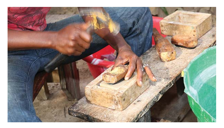
Bars of soap produced by the Menwo Production Center.

The project is key to the implementation of the small business empowerment act and the micro small and medium enterprise (SMEs) development in Liberia and helps strengthen the capacities of youth, women and agri-producing enterprises.