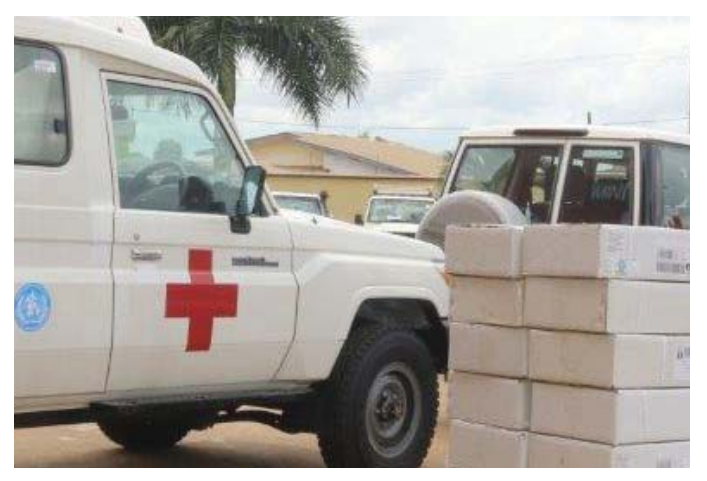
Ambulance and BB lotions donated by WHO to the Ministry of Health in Monrovia