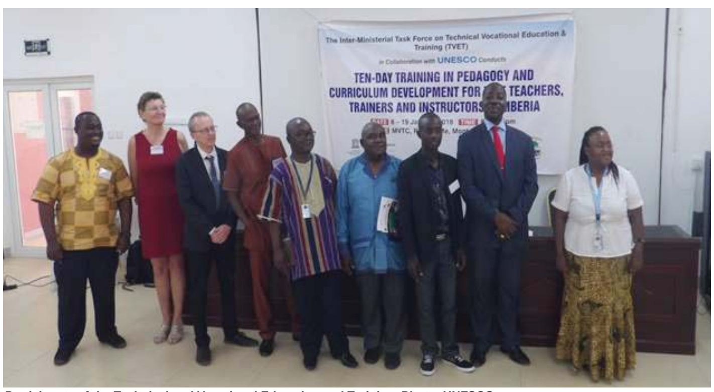
Participants of the Technical and Vocational Education and Training.

he Inter-Ministerial Task Force on Technical and Vocational Education and Training (TVET), in collaboration with UNESCO, organized a ten-day capacity building training for 150 TVET trainers and instructors in pedagogy and curriculum development skills.