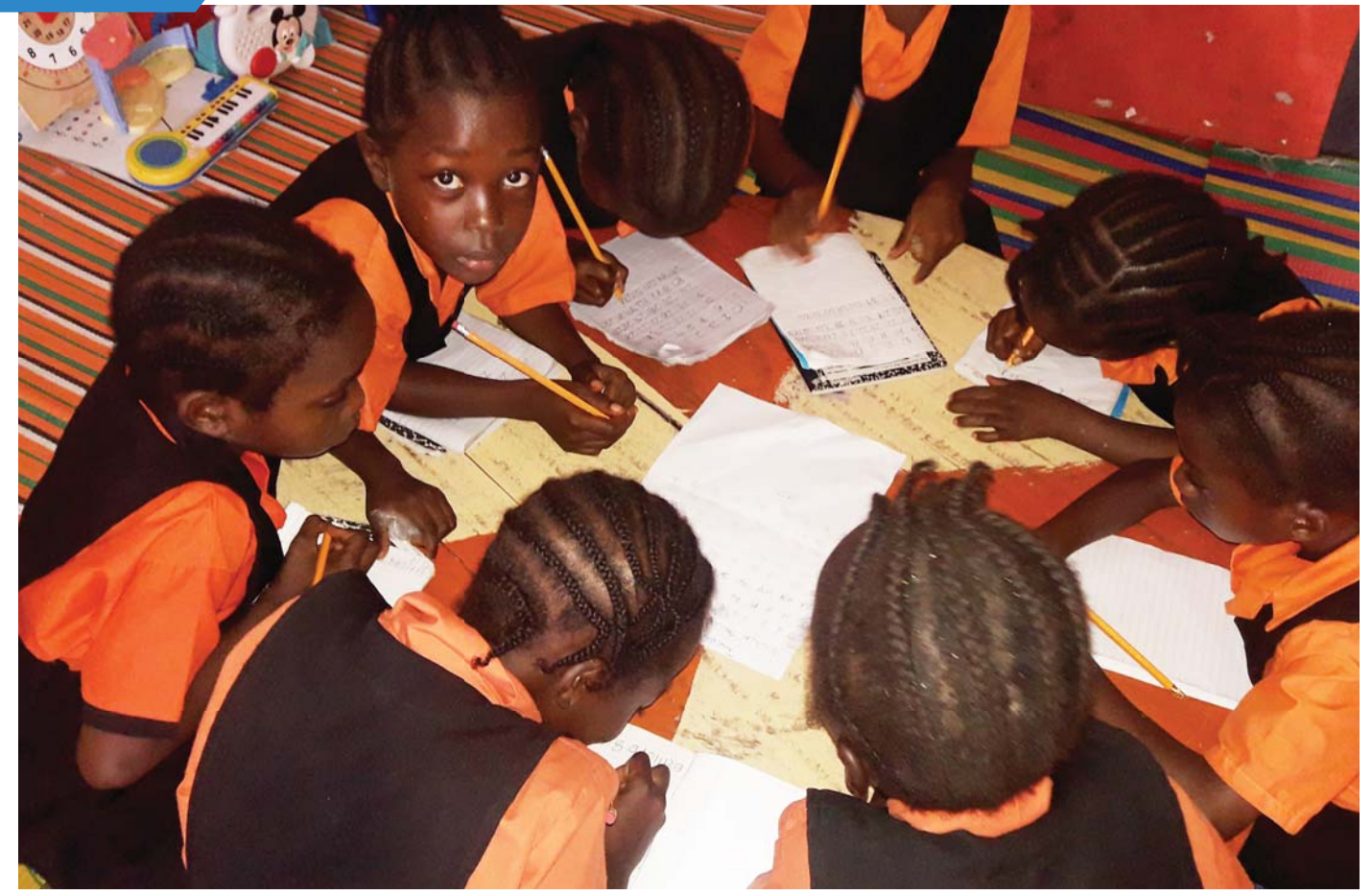
Children take part in an early childhood development class in Liberia.