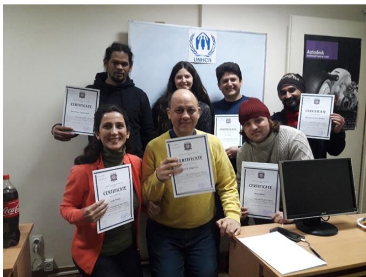
Refugees graduating from UNHCR funded Serbian language classes @UNHCR, Belgrade, 30 January 2019

CO in Belgrade, FU in South Serbia, regular monitoring presence in five Asylum Centres and 20 other sites accros the country