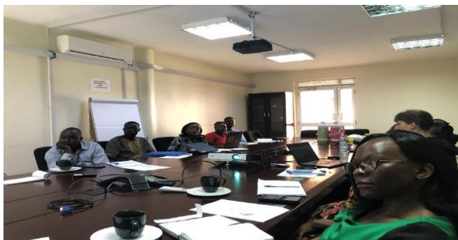
Kampala Level SGBV WG Meeting, 09 Jan

the launch of the Training manual and user guide on understanding Refugee Rights and Protection held on 31 January 2019. Modules in the training manual include Introduction to the Legal Frameworks Governing Forced Migration, Policy frameworks for the protection of Refugees and Asylum Seekers, Sexual Exploitation and Abuse, Rights and Obligations of Refugees and Asylum Seekers, Understanding Sexual Violence in Conflict, Challenges of Reporting on Refugees Media relationship with refugee-serving agencies, Journalism of Purpose: The ethics of reporting in refugee context and Being a Reporter, Being Human: How to interview refugees . Different modules shall be used for training different stakeholders based on relevance. Several participants, including the OPM, felt that that this training manual will enrich the knowledge and capacity of the stakeholders working for refugees. The training manual shall contribute in enhancing knowledge, capacity, communication and reporting on refugee issues.