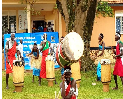
Refugees Performing during the launch of the FRRM