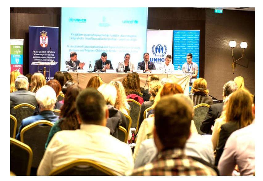
Round table "Protection of Unaccompanied and Separated Asylum-Seeking, Refugee and Migrant Children in Serbia -A Call for Action". @UNHCR. Belgrade. 12 March 2019

CO in Belgrade, FU in South Serbia, regular monitoring presence in five Asylum Centres and 20 other sites across the country