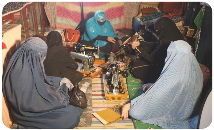
Afghan refugee girl is providing training to refugee women at her home @ Quetta / Baluchistan