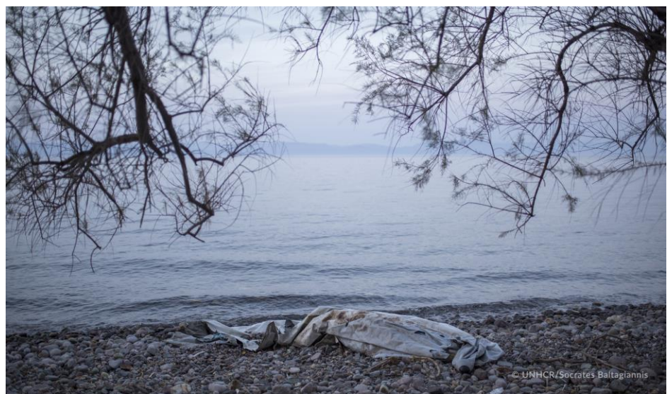
The remains of a rubber dinghy used by refugees and migrants to cross from Turkey to Greece

4 Field Units in Evros, Ioannina, Leros, Rhodes