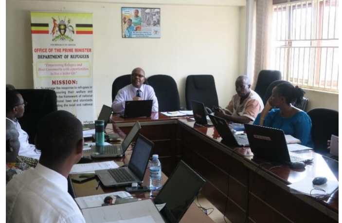
1<sup>st</sup> REC session of the Year on 20<sup>th</sup> February 2019