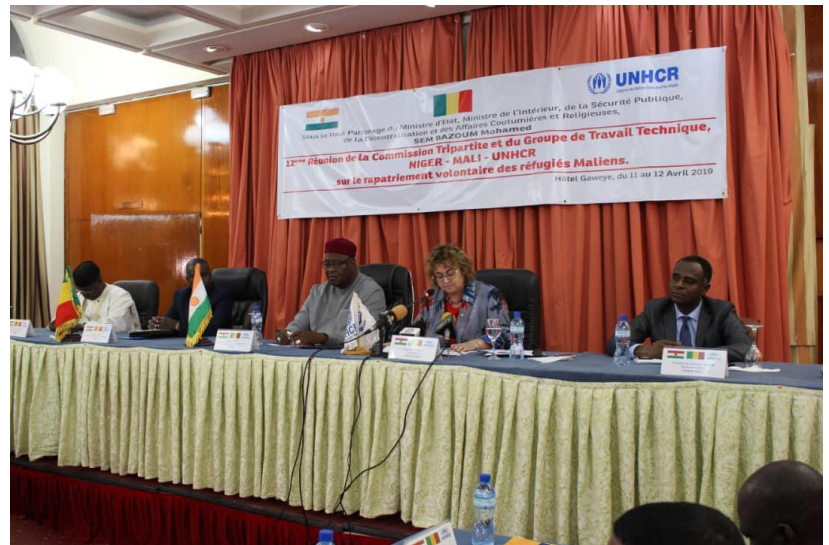
12th Tripartite meeting between the Governement of Mali, the Governement of Niger and UNHCR (UNHCR, April 2019).

From the 11th-12th of April, a Tripartite meeting between the Governement of Mali, Governement of Niger and UNHCR regarding the voluntary repatriation of Malian refugees was organized in Niamey. Due to the fragile security situation in Mali, all ctors confirmed the intention not to promote voluntary repatriation, while continuing to provide assistance to those who choose to return to Mali.