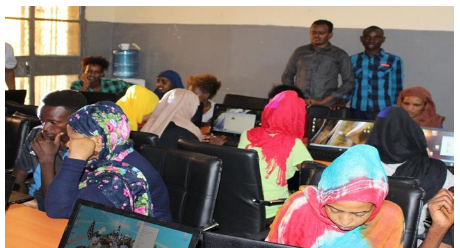
Refugees evacuated from Libya to Niger as part of the ETM, participate in IT training course in Niamey, Niger (UNHCR, April 2019).

An IT training was organized and offered to a group of 200 youth refugees evacuated from Libya through the ETM. The refugees were aged between 16 and 21 years old. The classes started in March and continued until mid-April. The beneficiaries, divided according to their IT knowledge level, took classes in Windows, Word, Excel, and PowerPoint. The trainings were carried out by UNHCR partner DEDI.