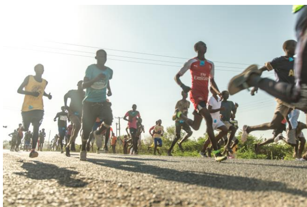
Refugee athletes compete in one of the 'We Run' athletics trial event in Kakuma refugee camp and Kalobeyei settlement.