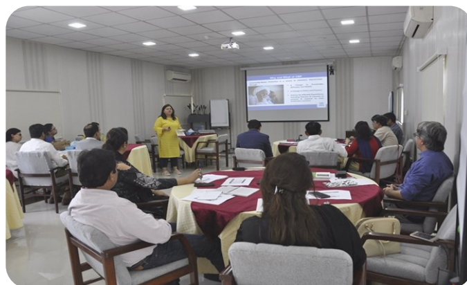
Training of new ICMC staff as CBP partner in Islamabad