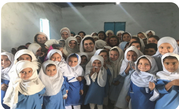
School mapping exercise in Kheski & Khairabad RV—Nowshera