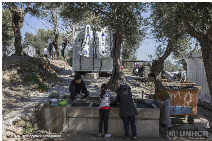
Refugees and migrants staying in the informal site next to Moria, Lesvos.

4 Field Units in Evros, Ioannina, Leros, Rhodes