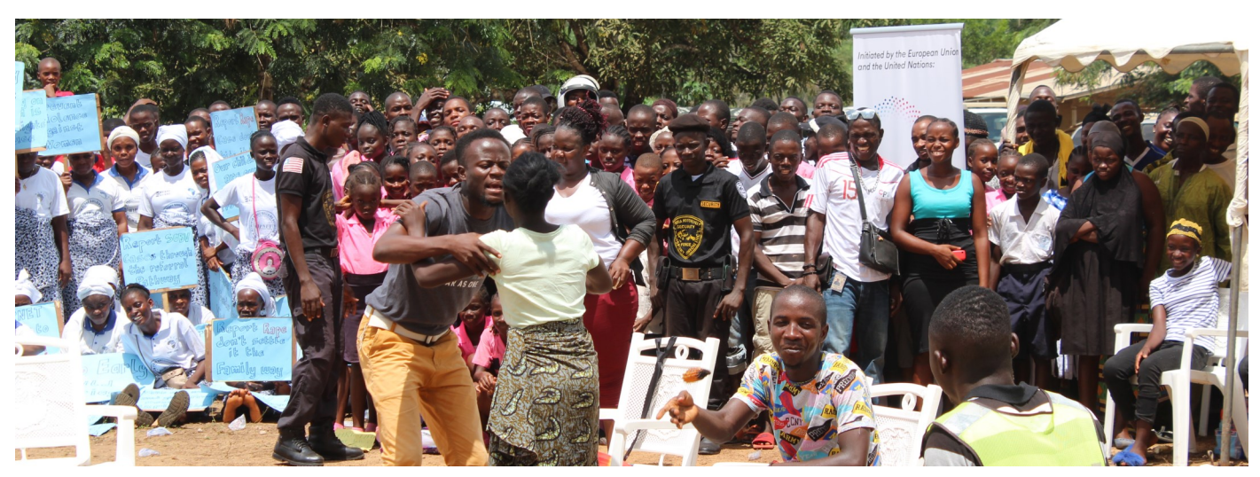
Community members take part in a drama performance showcasing action to end violence against women and girls.