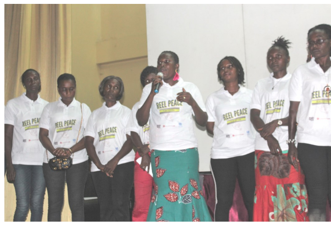
Some of the trained female filmmakers share their experiences during the Reel Peace Film Festival.

The films will also be screened in various communities across Liberia and will be featured at the European Union Film Festival later in the year.