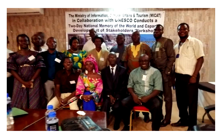
Participants and Facilitator of the National Memory of the World Capacity Development of Stakeholders workshop.

On 18 - 19 June 2019, the Ministry of Information, Culture and Tourism (MICAT), in collaboration with the United Nations Educational, Scientific and Cultural Organization (UNESCO), hosted a two-day 'National Memory of the World and Capacity Development of Stakeholders' workshop in Monrovia. The session had two objectives: