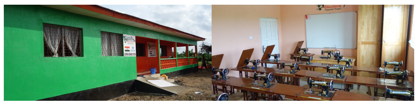
(L-R) Fully equipped Education Resource Center building and modern tailoring classroom handed over to the County Administration in Cestos City, River Cess County, by UNICEF and its partner NGO, KEEP.

The United Nations Children's Fund (UNICEF) and its implementing partner NGO, Kid's Education Engagement Project (KEEP), handed over a fully-equipped Education Resource Center to the County Administration in Cestos City in River Cess County in May 2019. River Cess County has some of the lowest education, health and other social development indicators.