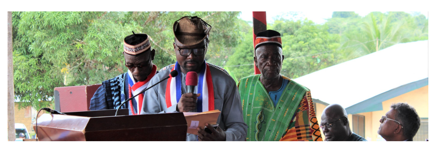
Traditional Leaders making remarks at the launch of the Spotlight Initiative in Liberia.

The Liberia Spotlight Initiative will also contribute to the achievement of the Pro-Poor Agenda for Prosperity and Development (PAPD).