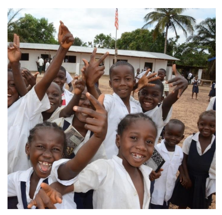
Students at a school where the WFP and government school-feeding programme is implemented.

Across the country, school feeding is currently implemented in 14 of Liberia's 15 counties by partners including WFP, Mary's Meals, Save the Children and ZOA. However, only about 18 percent of the nearly 1.5 million children enrolled in preprimary, primary and secondary schools eat at school.