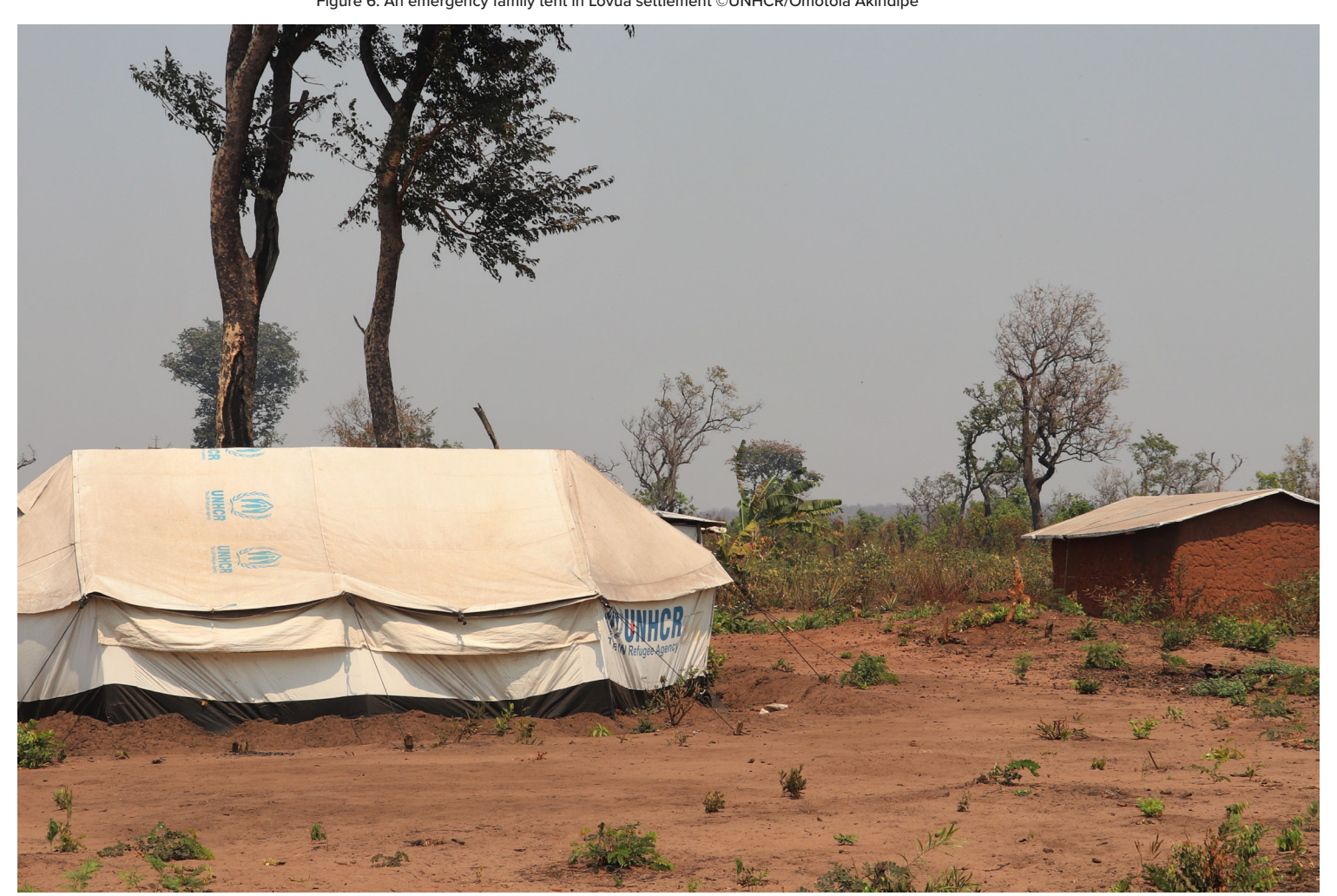
Figure 6: An emergency family tent in Lóvua settlement