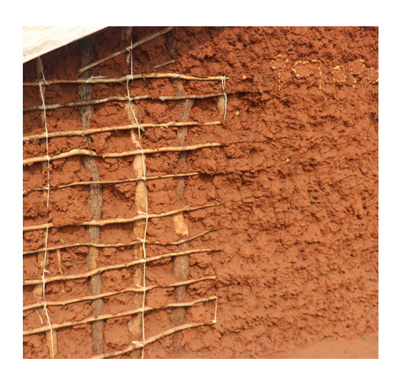
Figure 9: A timber grid house without the mud in Lóvua settlement ©UNHCR/Omotola Akindipe

Figure 8: A completed timber ppole home in Lóvua settlement ©UNHCR/Omotola Akindipe