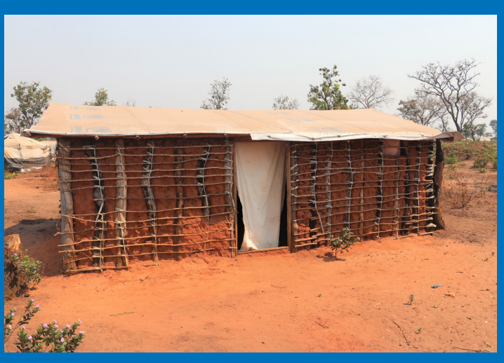
Homes with Timber Poles