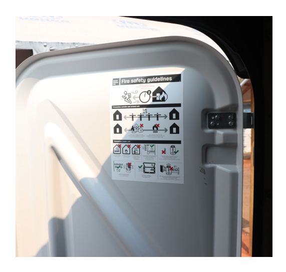
Figure 12: The inside of the door of an RHU with fire safety instructions ©UNHCR/Omotola Akindipe

Figure 13: A completed RHU in Lóvua settlement ©UNHCR/Omotola Akindipe