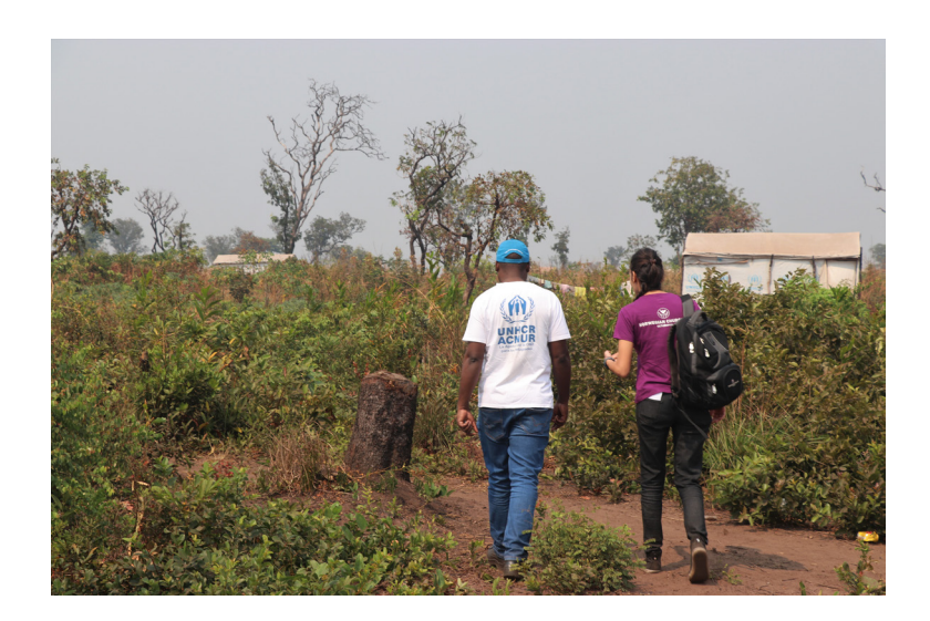
Figure 2: UNHCR and NCA lead the shelter response in Lóvua settlement