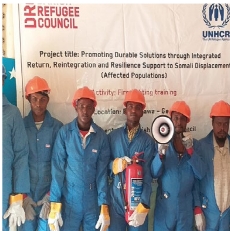
Fire safety training in Belet Xaawo, DRC/July 2019

Safety audits were completed in all sites of Kismayo during July. The findings will be presented in a joint workshop with all clusters and the local authorities.