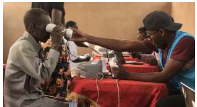
A refugee man completes biometric verification before receiving his family's NFI package in Khartoum. Abdelrahman/August 2019.

Khartoum's 'Open Areas' are informal communities hosting South Sudanese refugees where humanitarian needs are significant. There are 26,671 South Sudanese refugees biometrically registered 9 'open areas' in Umbadda, Jebel Aulia and Sharq El Nile localities of Khartoum State. The overall refugee population in these areas is estimated to be 57,000. They make up approximately 20 per cent of the overall South Sudanese refugee population in the State, and are considered among the most vulnerable refugee communities in Sudan.