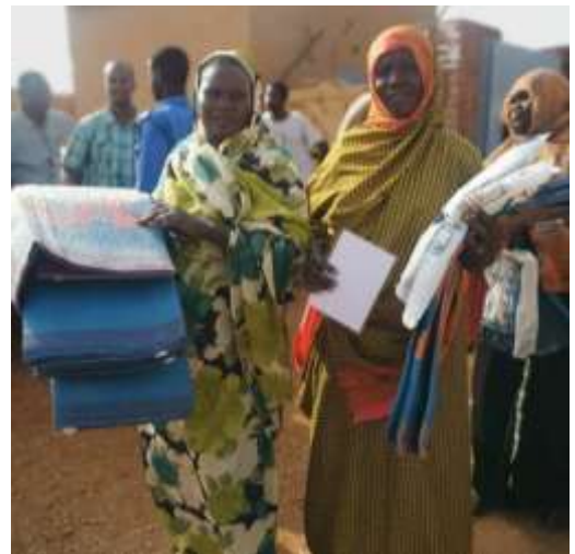
Refugees with NFI packages in Haj Yousef 'Open Area'. Abdelrahman/UNHCR/August 2019.

– From 23 June to 7 August, UNHCR and the Government of Sudan's Commission of Refugees (COR) distributed NFI kits to over 13,405 South Sudanese refugee households across 9 'open area' settlements in Jebel Aulia, Sharq El Nile and Umbadda localities in Khartoum State. An additional 2,142 vulnerable host community households also received NFI kits. The kits contained mosquito nets, plastic sheeting and sleeping mats, as part of UNHCR and COR's rainy season preparedness in the 'Open Areas'. The distribution included 365 newly displaced South Sudanese refugee families who fled to the Bantiu site in June following attacks in Khartoum. Newly displaced families also received jerry cans provided by UNICEF. UNHCR and COR plan to provide NFI support based on assessed needs in other neighbourhoods in Khartoum where South Sudanese refugees and local residents have been affected by recent flooding.