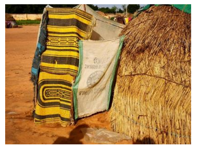
Makeshift toilet for Men in IDP camp in Rabah LGA, Sokoto State

reported by health workers in the camp that the water was contaminated and unsafe for consumption. The local government representatives disclosed that there is a bore hole and water pump in the camp, which needs repairs. In camps in Katsina, Sokoto and Zamfara states, the team observed water pumps, where the IDPs queue to get water. Also, in Katsina state, water trucks are stationed in the camps to supply water to the IDPs. There is a significant need for sanitation materials and delivery kits for the women, according to health workers in the camps.