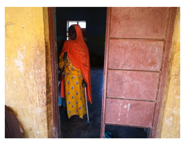
Physically challenged elderly woman in an IDP camp in Zamfara State.

The team identified elderly male and female heads of households. They reported that as a result of the crisis, they had lost their children and have become primary caregivers of their grandchildren. They lamented that they find it difficult to feed and cater for them. The team also identified elderlies that are physically challenged, some are without support, and depend on the goodwill of other IDPs.