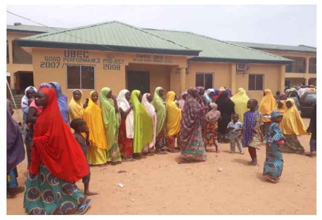
New arrivals being registered in an IDP camp in Katsina state.

The local government representatives and SEMA in the states informed that the IDPs are registered according to households. They also register new births and new arrivals. In Batsari LGA. Katsina state, the team observed new arrivals being registered by local government officials.