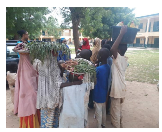
Children hawking wares in the IDP camp in Faskari LGA, Katsina State.

Across the states, the team observed younger IDP children with bowls, begging, and older children, especially girls, hawking wares within and outside the camps.