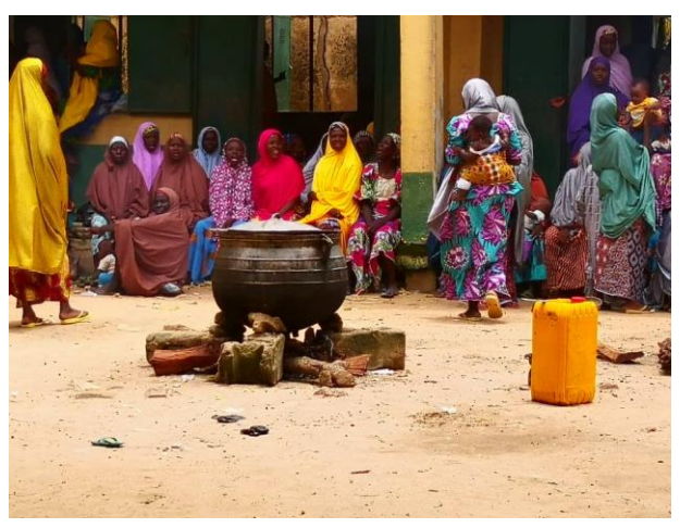
Communal cooking in an IDP camp in Katsina State.

In Sokoto and Zamfara states, dry rations of food are provided in the camps by the state and local government, with little or no condiments or utensils for cooking.