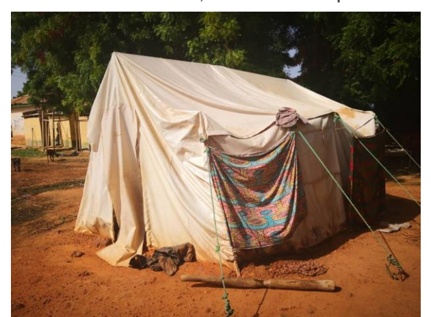
Makeshift tent in IDP camp in Rabah LGA, Sokoto State.

In the states visited, the IDPs are provided with temporary accommodations, mainly in the