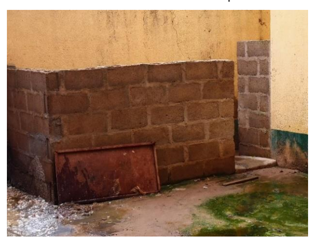
Female toilet camp Faskari LGA in Katsina State.

The WASH facilities in most camps across the 3 states are appalling. In Faskari LGA, Katsina,