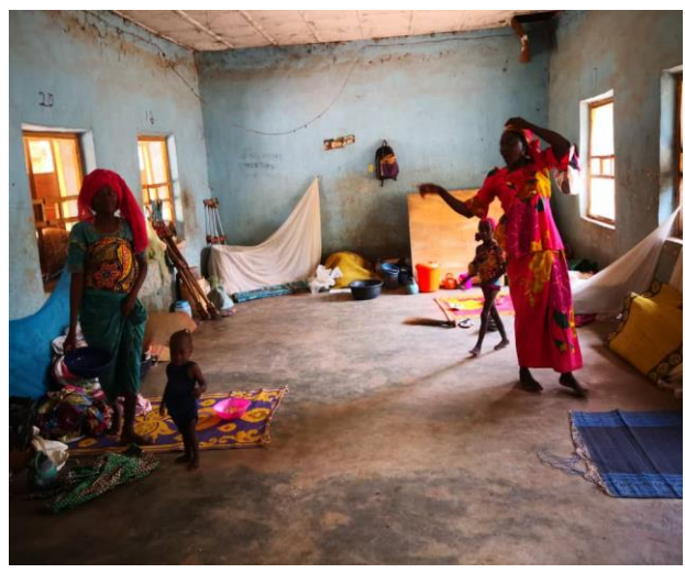
Shelter for women and children in an IDP camp in Zamfara State.

headed households in the IDP camps and host communities, across the states. The women whose husbands were either killed. kidnapped or cannot be located, often have to fend for large families, with little or no means of income. Some IDP women living in host communities in Isa and Sabon Birni LGAs, Sokoto state, reported that they have to take up any available jobs in the struggle to feed their families. IDP women in camps and host communities, repudiated the notion of survival sex, when asked, stating that their village heads will not deal kindly with such practices. In some camps, the women have little or no privacy. They sleep in rooms