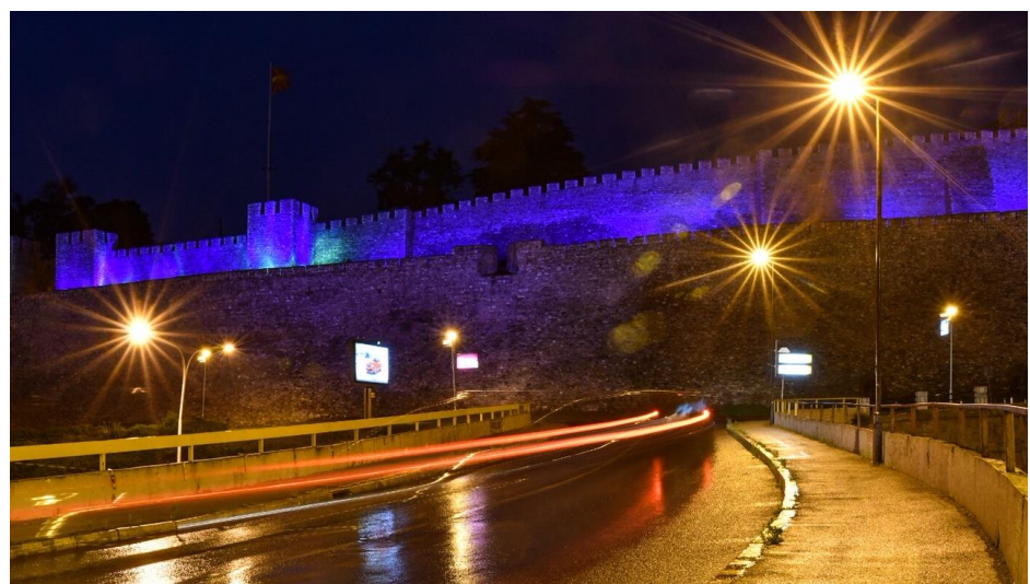
World Refugee Day awareness raising – lighting of Kale Fortress in blue, 20 June 2019, Skopje

1 Representation Office in Skopje, with daily field presence in Tabanovce, and 1 Field Unit in Vinojug Reception and Transit Centres