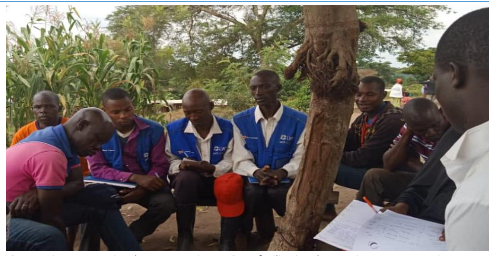
Community structure in advocacy meeting on CFPU facilitating the meeting at Rwamwanja post SGBV prevention and response in Ntenungi police out post