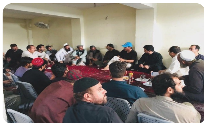
Meeting with community and outreach volunteers Muzaffarabad, Azad Kashmir