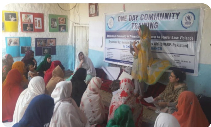
Training session on SGBV for female refugees in Panian RV Haripur, KPK