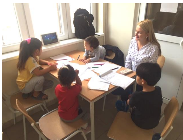
Supporting the education of asylum-seekers' children , ©Sigma plus, 1 October 2019

CO in Belgrade, FU in South Serbia, regular monitoring presence in five Asylum Centres and 25 other sites across the country