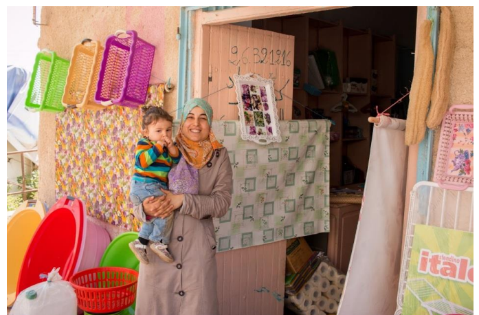
Syrian refugee set up her own business in Nabeul thanks to livelihood programme carried out with UNHCR partner ADRA in 2018