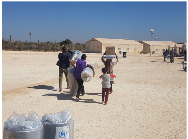
Distributions of emergency NFI kits in Jebel Saman, Aleppo and Maaret Tamsrin, Idleb

Moreover, UNHCR's protection partners conducted awareness raising and psychosocial support sessions, identified cases and referred them to basic services in Idleb and Aleppo Governorates; such community-based protection interventions reached 9,555 people . In addition, 7,092 displaced and vulnerable people received protection services such as awareness raising on civil status documentation and housing, land and properties, legal counselling and assistance, case management and referrals. As a part of the emergency response, sessions on integrated protection awareness, protection risk awareness, information and psychosocial first aid are conducted by UNHCR's partners and people are referred to the needed internal and external services. Those interventions reached 1,020 newly displaced people from northern Hama and southern Idleb.