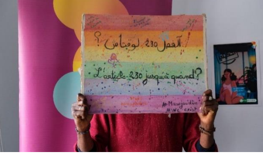
Refugee and asylum seekers participate in the advocacy for LGBTIQ rights in Tunisia

orientations in Tunisia. Several NGOs are present in different areas the country, providing counselling, psychological support, recreational activities. legal support, and carrying out activities for the prevention of sexually transmitted diseases for the benefit of the LGBTIQ refugee community. The inclusion of refugees and asvlum-seekers such programmes is essential for their protection.