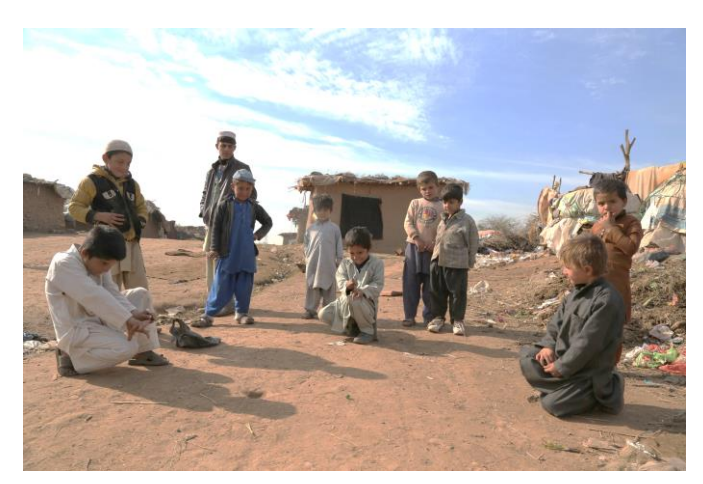
Afghan refugee children playing in the I-12 Afghan settlement in Islamabad.

* The voluntary repatriation process resumed on 1 March 2019 at the two Voluntary Repatriation Centres in Pakistan. Please refer to the UNHCR Afghanistan Situation Data Portal and the UNHCR Pakistan website for the latest updates.