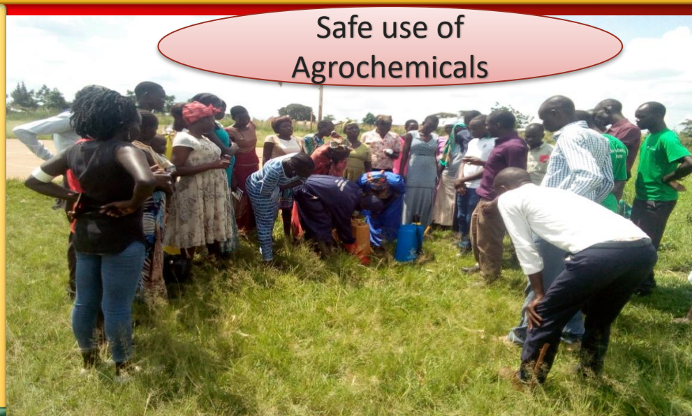
Safe use of Agrochemicals