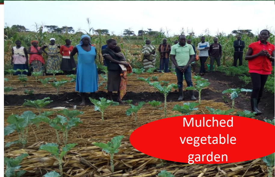
Mulched vegetable garden