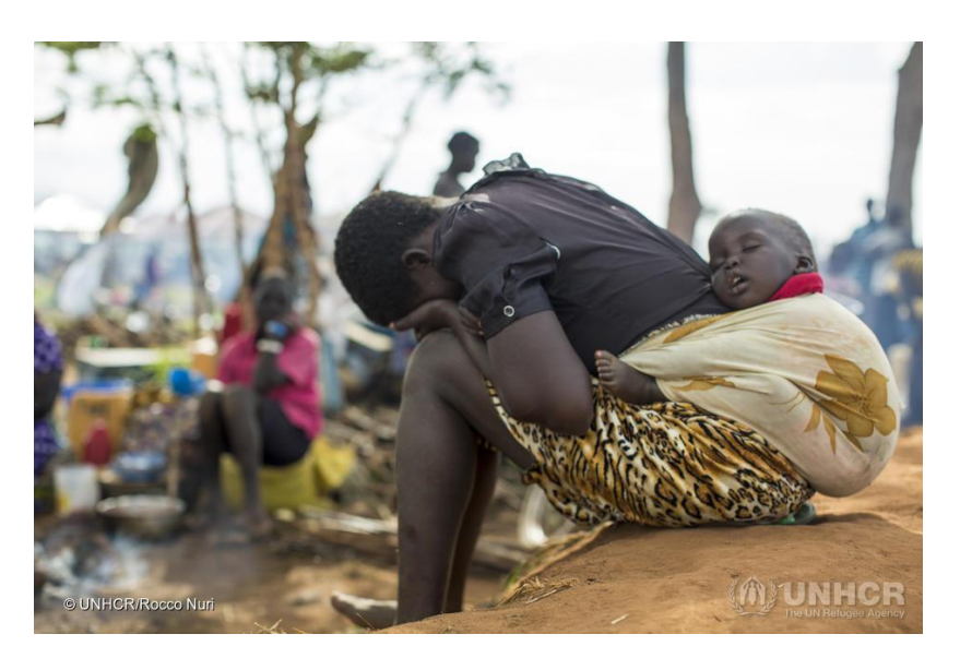
Thousands flee violence in South Sudan; Uganda, April 2017.

In times of emergencies and humanitarian interventions, emotional wellbeing and mental health is still too often overlooked. However, the mental and psychosocial consequences of forced displacement and armed conflict can be manifold, encompassing social problems, emotional distress and common mental health disorders (e.g. anxiety disorders, PTSD, depression), severe mental disorders (e.g. psychosis), alcohol and substance use disorders and intellectual disabilities. A recent WHO study estimates that one in five people in (post)-conflict settings suffer from depression, anxiety disorder, PTSD, bipolar disorder or schizophrenia. The need for mental health and psychosocial support (MHPSS) in the context of forced and protracted displacement is immense and needs to be responded to in a comprehensive and coordinated manner. Mental health and psychosocial problems pose a threat to individuals, families and communities and can result in immediate, mid- and long-term consequences (including significant intergenerational effects).