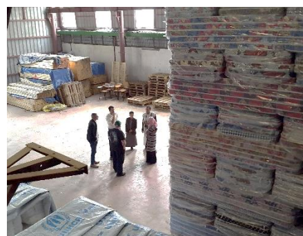
UNHCR visited partner YDF's warehouse in Sana'a before the distribution of household items. Over the coming days, a total of 503 IDPs, IDP returnee families and vulnerable host community members will receive assistance.

Special thanks to our major donors: United States of America | Thani Bin Abdullah Bin Thani Al-Thani Humanitarian Fund | Kuwait | Country-Based Pooled Funds | Qatar Charity | United Kingdom | Japan | European Union | Finland | Sweden | Qatar | Saudi Arabia | Canada | France | Spain | Switzerland | Belgium | Miscellaneous donors in Egypt | Republic of Korea.