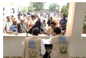
UNHCR provided 50 basic household item packages and 50 emergency shelter kits to a Shelter/NFI Cluster partner to respond to newly displaced families in Maqbanah district, Taizz governorate. The partner also provided technical support for the installation

UNHCR, through partners, has completed the distribution of 102 basic household item packages and 37 emergency shelter kits to IDPs families who mostly fled from frontline areas in Sa'ada governorate. Clashes between SLC-backed forces and the de facto authorities were reported along the Saudi-Yemen border of Sa'ada, mainly in the western districts, causing civilian deaths, casualties, displacement and loss of property. In addition, 464 IDP families received basic household items in the central district of As Safra. So far this year, some 9,000 IDP families have received basic household item packages in Sa'ada governorate.