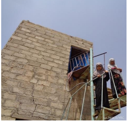
Two displaced girls stand on the staircase of their rented house in Amran. The family fled from Hajjah after the recent escalation of fighting. UNHCR assisted them with CRIs.

governorates was finalized, targeting 15,888 households for multi-purpose protection (10,662) and shelter needs (5,226). As of 31 March 2019, 87 per cent of targeted families had collected their assistance. Needs assessments for UNHCR-led Shelter and Site Management coordination continue. Partner NCR assessed 500 families in Houth hosting site in Amran governorate. Houth is one of the 88 sites the cluster has assessed and verified as being critical this year. In Bani Hushaysh district in Sana'a governorate, cluster partner YGUSSWP carried out an assessment of 591 IDP families and those from the extremely vulnerable host community. Emergency items will be released on 7 April to person in this group.