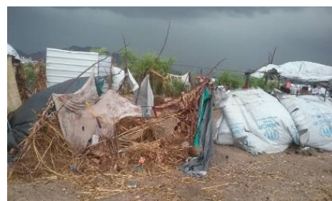
IDP shelters in Hajjah have been completely destroyed due to torrential rains. The risk of cholera and other water-borne diseases remains a grave concern.

Special thanks to major donors: Belgium | Canada | Denmark | European Union | Germany | Japan | Republic of Korea | Netherlands | Norway | Qatar | Saudi Arabia | Spain | Sweden | Switzerland | United Kingdom | United States of America |