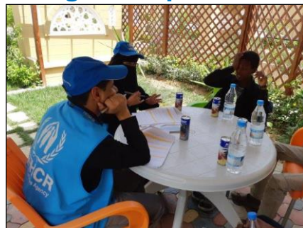
UNHCR protection team talks with a child refugee (aged 12). The child's father had passed away and he was found in Sa'ada city looking for an opportunity to travel to Saudi Arabia "to find a job to support my family especially my sick old mother". The community where the child is originally from has been informed. He was living with his family in Sana'a and made a living washing cars. UNHCR decided to accompany the child back to his family and provide other necessary protection assistance after a thorough verification.

Child protection continues to be a paramount concern and over the week, six unaccompanied children (UAC) from Ethiopia approached UNHCR and expressed their wish to seek asylum. The children were registered and counselled by UNHCR staff on the available services for UACs, such as care arrangement through a specialized shelter or a foster care family. In the end, three children out of six agreed to be referred to the UAC shelter, managed by the Ministry of Social Affairs and Labour. The others chose to live with friends. All the children will have access to formal and/or non-formal education, referrals for health services and be regularly monitored by the protection partner. The UAC programme is designed so that when the child turns 18 years old, s/he will be prepared to be independent and leave the UAC shelter or foster family. During the first six months of 2019,