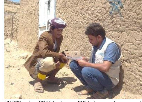
UNHCR partner YDF interviews an IDP during a needs assessment exercise in Sa'ada governorate.

and floods across the country with NFIs and shelter kits. In Aden, UNHCR and partner NMO assisted 56 conflict-affected families (305 individuals, mostly women and children) in Buraiqa district. In Sa'ada, UNHCR and partner YDF reached 500 IDPs families in Ghamr district, with NFI kits. Families received blankets, mattresses, kitchen sets, mosquito nets, water buckets, sleeping mats and solar lamps. Some 800 families were also provide with mosquito nets in Houth district, Amran Governorate.