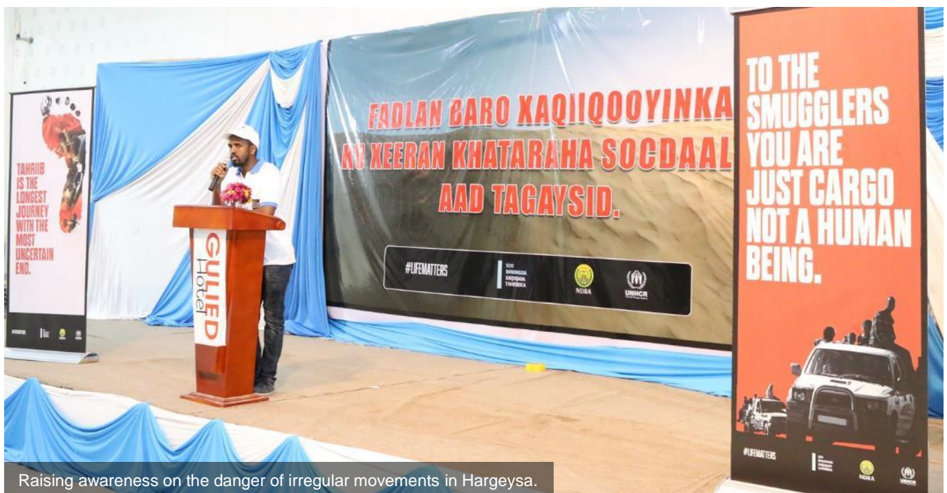
Raising awareness on the danger of irregular movements in Hargeysa.

In an effort to respond to this devastating situation, UNHCR rolled out an information campaign titled Telling the Real Story aimed to inform communities in Somalia of the full scope of the perils and difficulties of such journey .