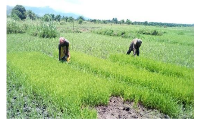
Refugees and local farmers work together on a rice field outside Lusenda camp.

UNHCR's partner AIDES distributed 536 solar lamps to Refugee Committees, unaccompanied children and