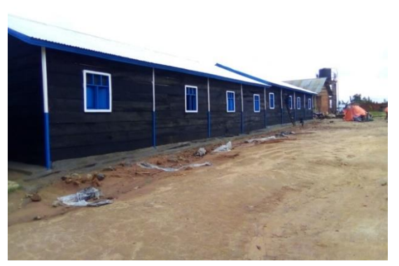
The soon-to-be inaugurated Mwangaza primary school, rehabilitated in Beni Territory.