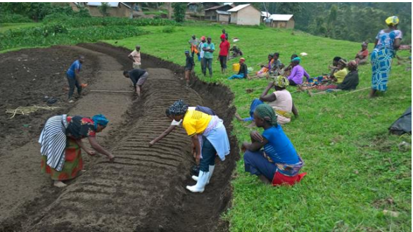
People receiving training on agricultural techniques from ANPT-PP agronomists, UNHCR's partner.

project also includes the rehabilitation of an 8-classroom primary school currently occupied by IDPs in Oicha, Beni Territory. This is to facilitate IDPs' access to education and promote peaceful coexistence with the local community.