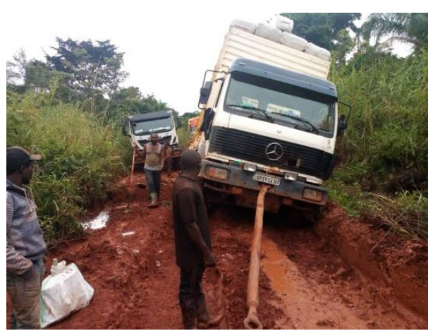
The severely damaged road to Bele, Haut Uele Province.