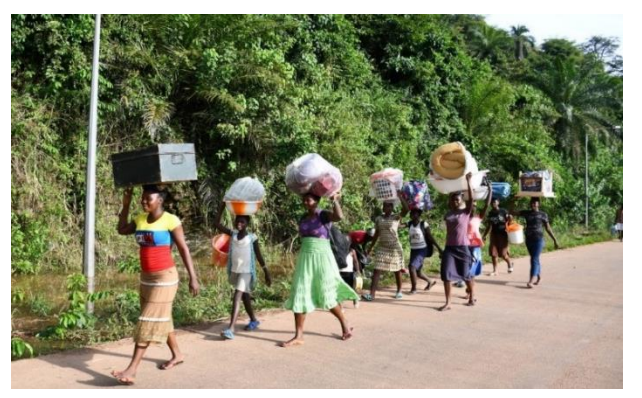
Central African refugees after floodwater destroyed their houses in Mobayi, 25km from Gbadolite, Nord Ubangi Province.

now access security, healthcare, education and other basic services in Inke camp. They also received clothes and other basic items. UNHCR and partners are evaluating the number of refugees who need to be relocated for similar reasons.