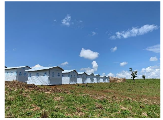
Shelter construction in Drodro, Djugu Territory.

UNHCR recorded the presence of a total of 9,184 households (41,525 persons, including 23,044 women and 18,481 men) in nine out 12 IDP sites coordinated by UNHCR in Ituri, as part of an ongoing exercise to collect information on IDPs' needs and socio-economic profiles. Registration continued in the three remaining sites of Drodro, Rho and Bule (Djugu Territory).