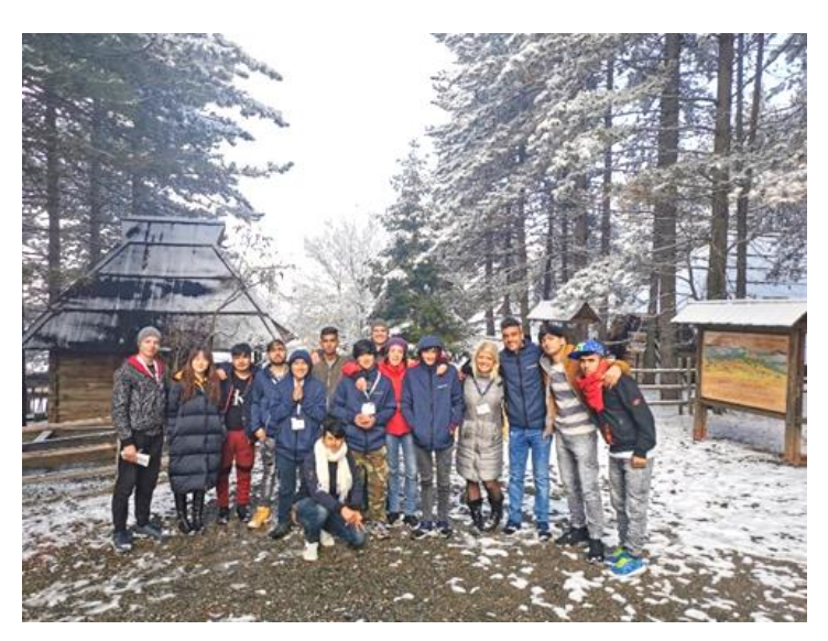
UASC peer educators in Sirogojno, Zlatibor, ©DRC, 4 December 2019