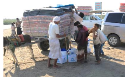
Displaced families in Hudaydah governorate receive their basic household items. Between 5-9 January, UNHCR assisted 2,195 families with emergency items.

UNHCR, through partners, completed the implementation of two Quick Impact Projects (QIPs) in Al Jawf governorate. The first is construction of a 30-student capacity classroom for girls, as requested by local authorities in Barat Al Anan district. The second is an enhancement to a water point in Al Humaydat district with solar paneling, to improve sustainability of the facility. UNHCR installed two water tanks with a total capacity of 6,000 liters in 2018, aiming to improve the health and well-being of both IDP and host communities by reducing the prevalence of water and sanitation-related disease through provision of safer water sources, while also promoting peaceful and dignified co-existence.