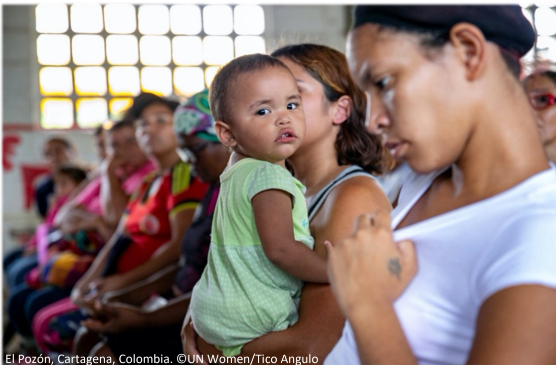
El Pozón, Cartagena, Colombia.