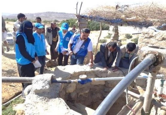
Installation of a solar panel for the water point at Mathab Al Waghra IDP site, Al Jawf governorate.

Special thanks to our major donors: Sweden | Denmark | Norway | Netherlands | United Kingdom | Germany | Switzerland