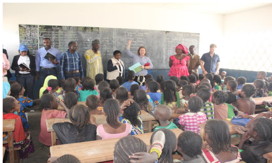
Joint Team of BPRM, OFDA and Food for Peace visiting refugee children (Central Africans) in a classroom at the Gado site in the East region.