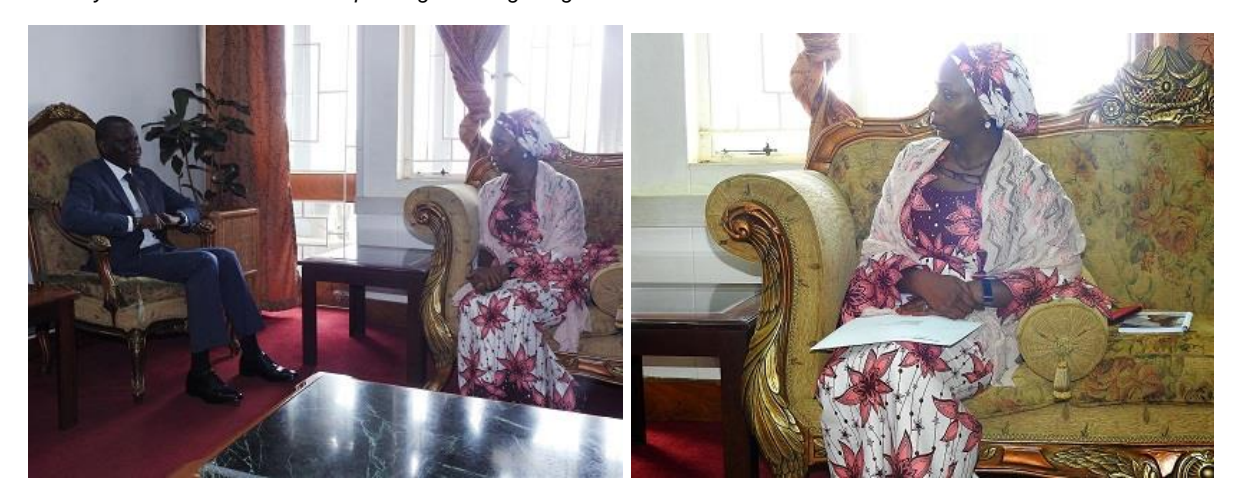
The minister engages the new Representative in a discussion which mostly centered on UNHCR's work in Malawi over the years in assisting refugees, asylum seekers and internally displaced persons.