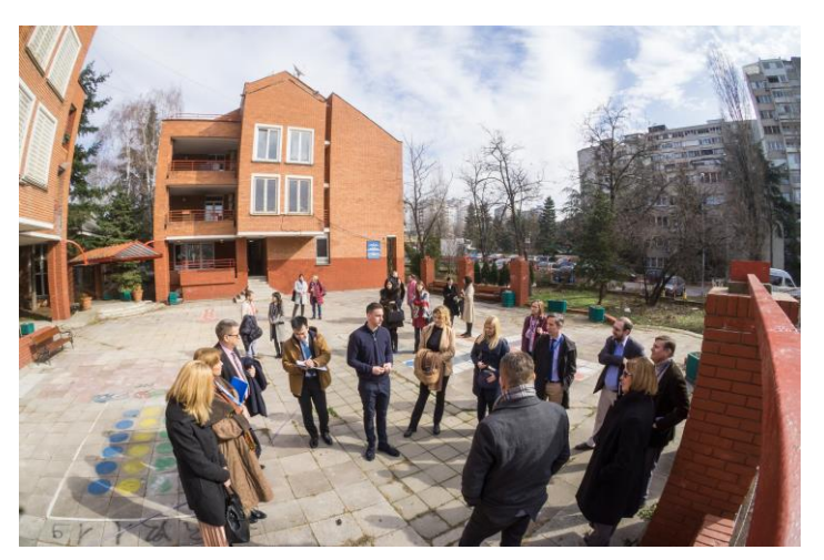
The Ministry of Labour, Employment, Veterans and Social Affairs, UNHCR and potential donors visit special centres for unaccompanied and separated refugee children in Belgrade, ©UNHCR, February 2019

CO in Belgrade and FU in South Serbia for regular protection monitoring in five Asylum Centres and 25 other sites across the country