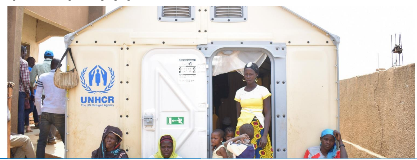
POPULATION OF CONCERN