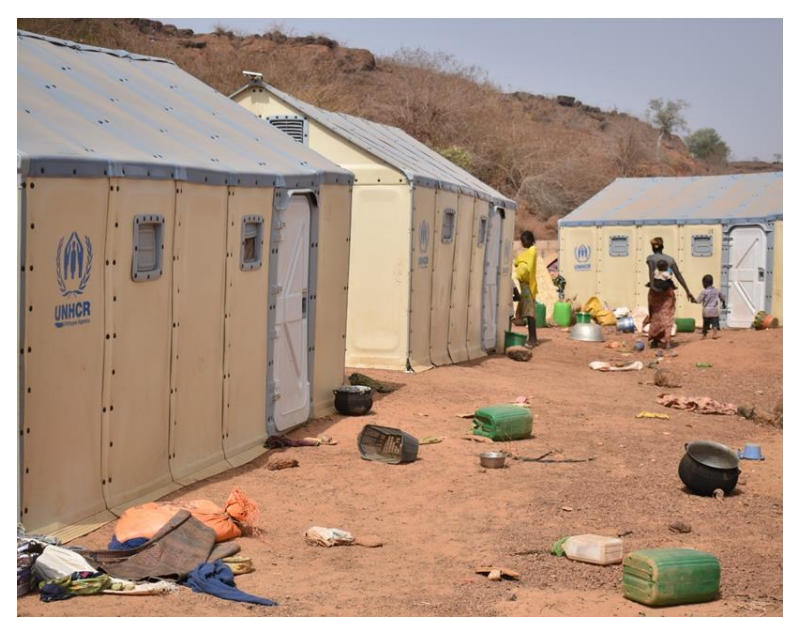
RHUs constructed in Kaya to host IDPs newly arrived from Pensa, following recent attacks that killed 9 civilians.

• 30 community workers, and 08 Government agents were trained from 24 – 26 February