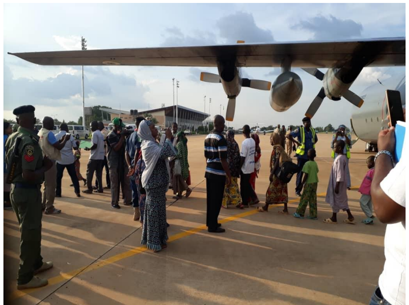
Refugee repatriated from Cameroon arrived to Yola, Adamawa State.

06 Field Units in Damaturu, Gwoza, Bama, Ngala, Monguno, Banki