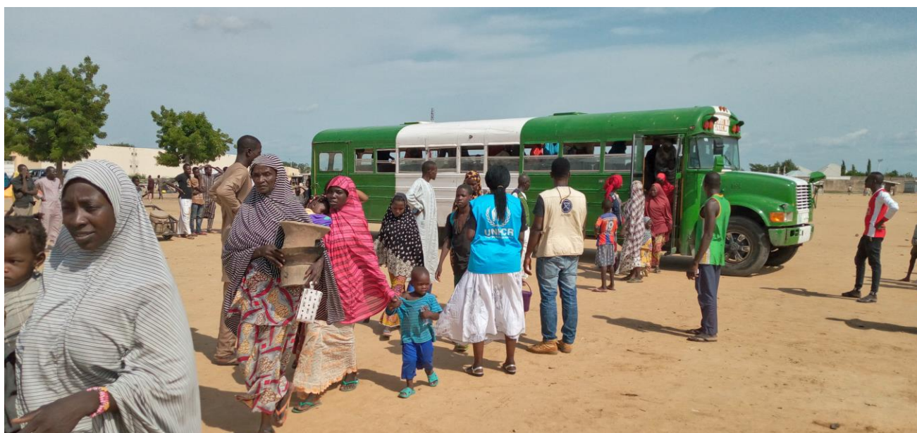
Relocation of IDP from TVC camp to Stadium camp. July 2019