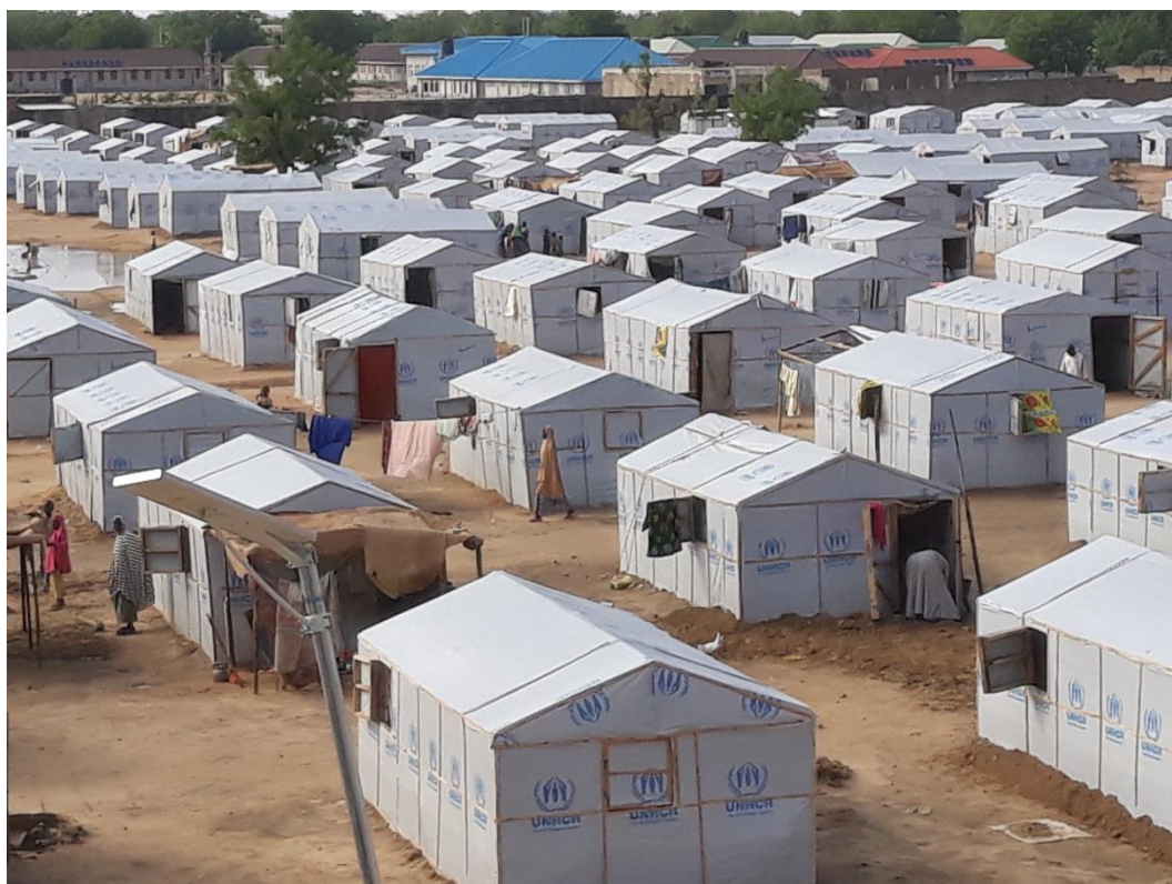
Emergency shelter at the Stadium camp.

On 14 July, the Governor of Borno State announced his intent to organize an economic summit to develop a blueprint for economic recovery as part of the post insurgency development strategies. From 16 to 18 July, the 2nd Lake Chad Basin Commission Governors Forum was held in Niamey, Niger to find a holistic approach in the fight against insurgency, and ensure stability, peace and sustainable development in the Lake Chad Basin. During his visit to Niamey, the Governor of Borno State met with refugees to reassure them of his effort to secure their areas of origin in preparation for their return. He also donated 10,000 bags of assorted grains to support their food needs.