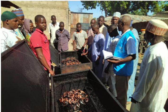
UNHCR Head of Field Unit (right) Damaturu exchanges with fishermen in UNHCR Livelihood Center in Damasak.