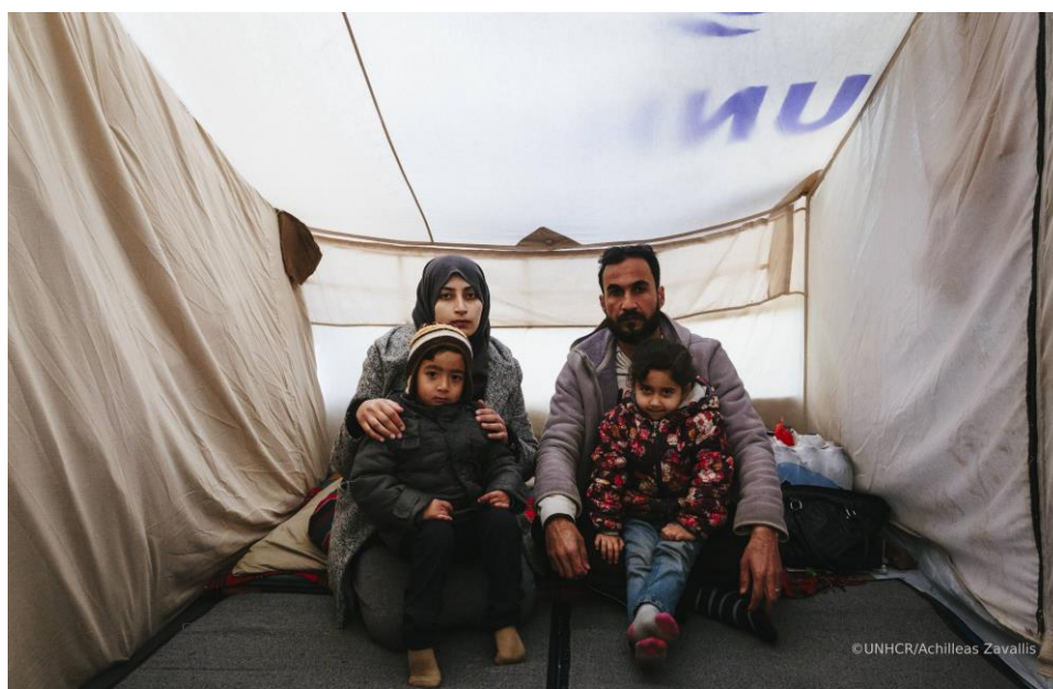
Asylum-seekers inside a UNHCR family tent in Moria reception centre, Lesbos.

4 Field Units in Evros, Ioannina, Leros, Rhodes